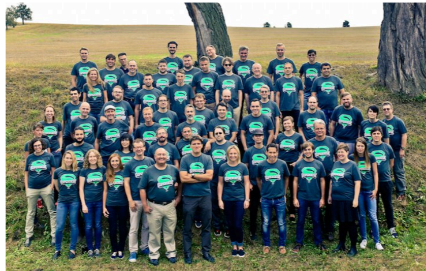
Sourcecamp 2016, annual company conference

Our mission is to offer professional-grade technology to all who believe that quality independent journalism has a fundamental role to play in any healthy society.